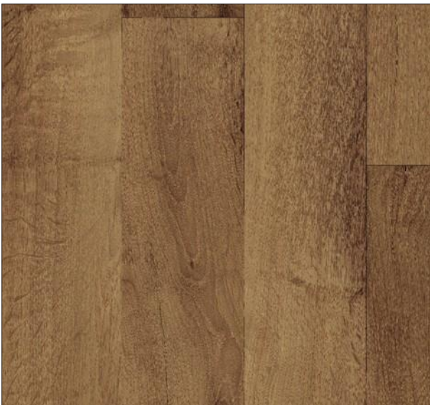
Gea / Dark Beige -27123057