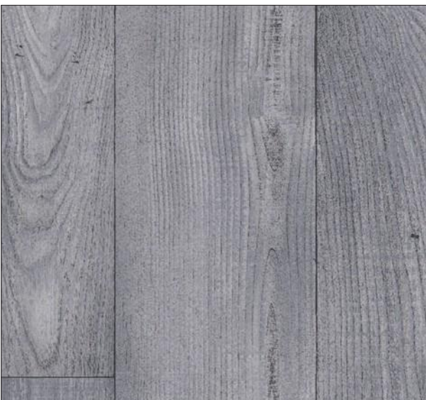
Old Meleze / Grey -27123022