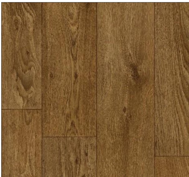
Faro 2 / Brown -27123054