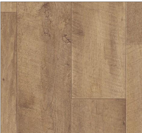
Authentic / Natural -27123026