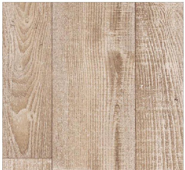
Old Meleze / Dark Grey -27123064