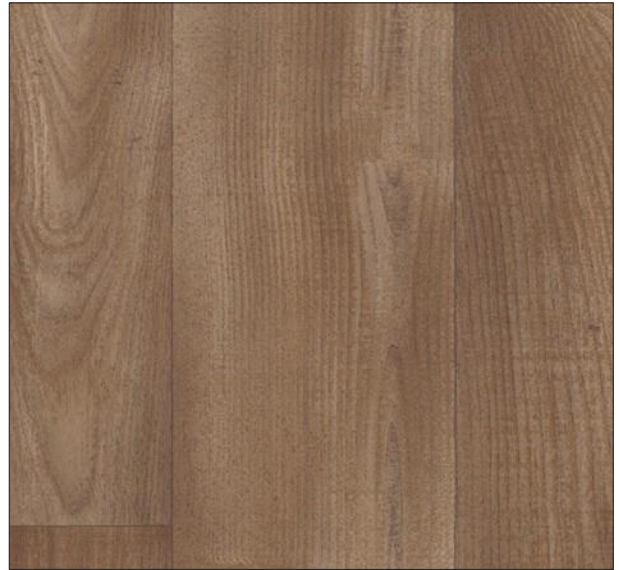
Old Meleze / Brown -27123065