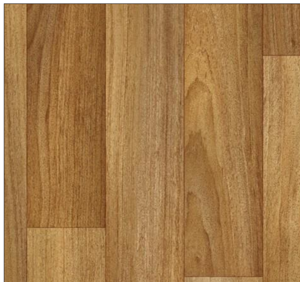
Pear / Natural -27123066