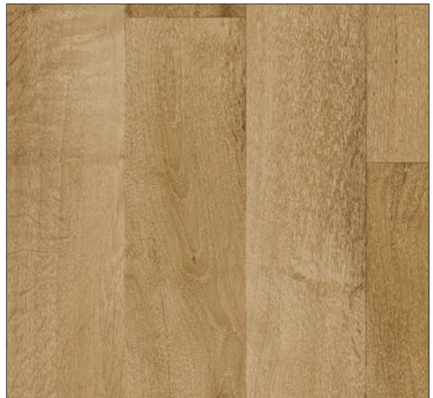
Gea / Light Brown -27123027