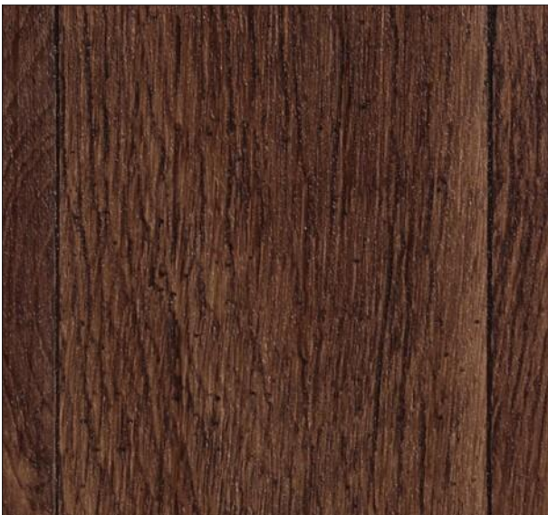
Berkley / Chocolat -27123048