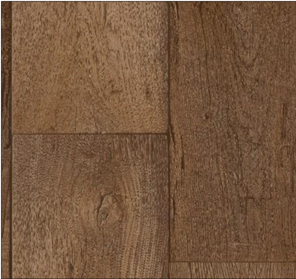
Flanders / Beige Brown -27123055