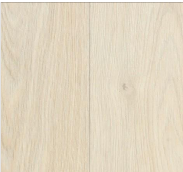
Amboise /Blanc -27123043