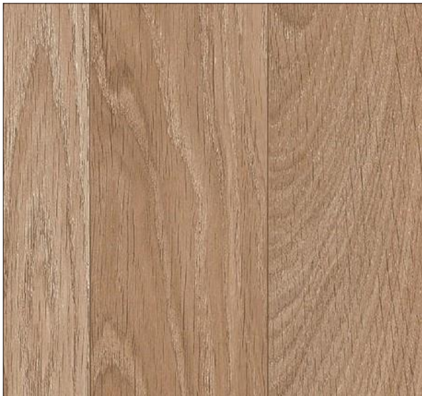
Biscay 2 / Brown -27123050