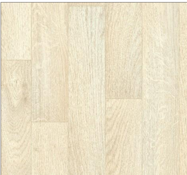
Robur / White -27123032