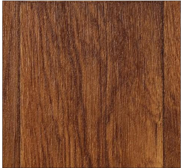
Berkley / Moyen -27123049