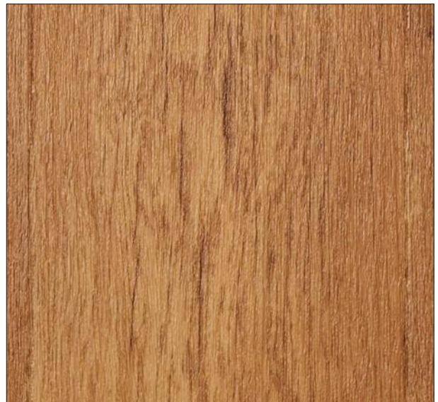
Kent / Moyen -27123061