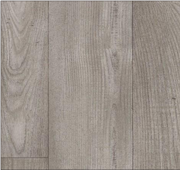
Old Meleze / Light Brown -27123095