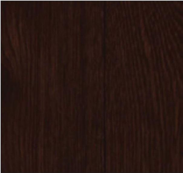
Amboise / Chocolat -27123025