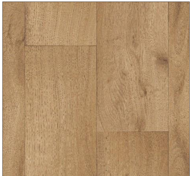
Arcadia / Natural -27123039