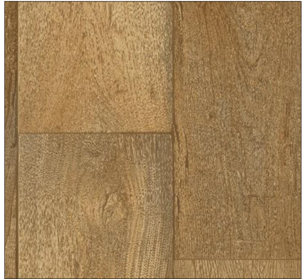
Flanders / Dark Beige -27123056