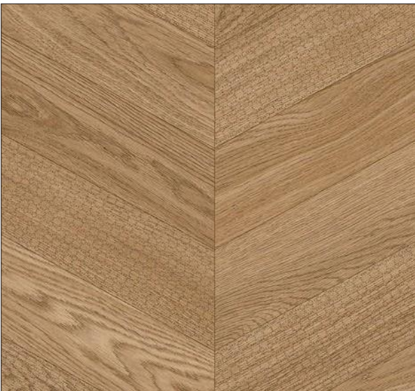
Chevron Tattoo / Caramel -27123129