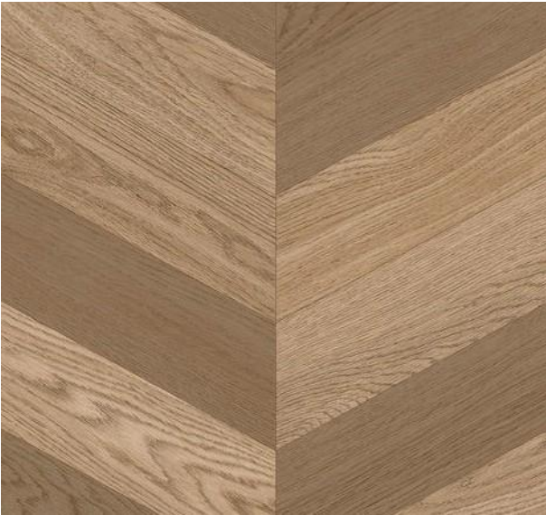
Chevron Style / Caramel -27123131