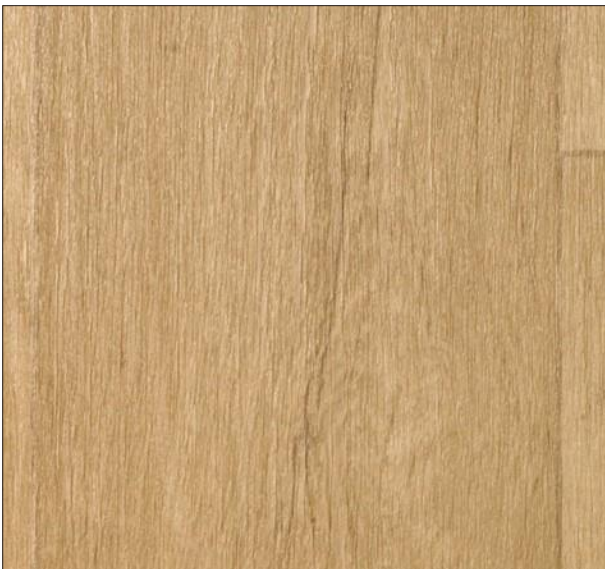
Kent / Clair -27123028