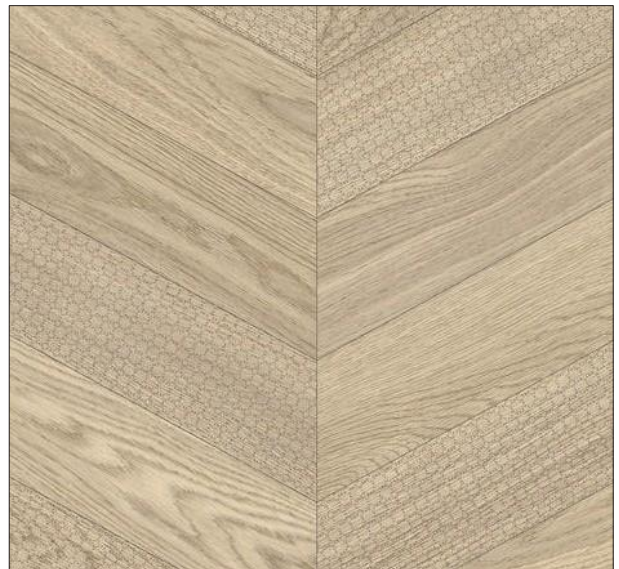
Chevron Tattoo / Smoked -27123130