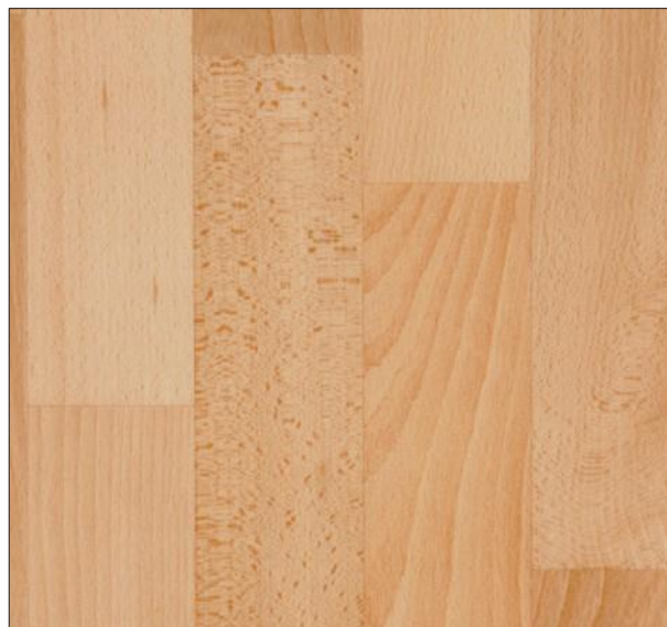
Beech / Beige Brown -27123031