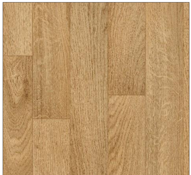
Robur / Yellow -27123067