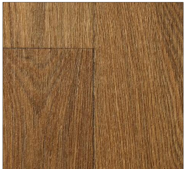
Amboise / Naturel -27123042