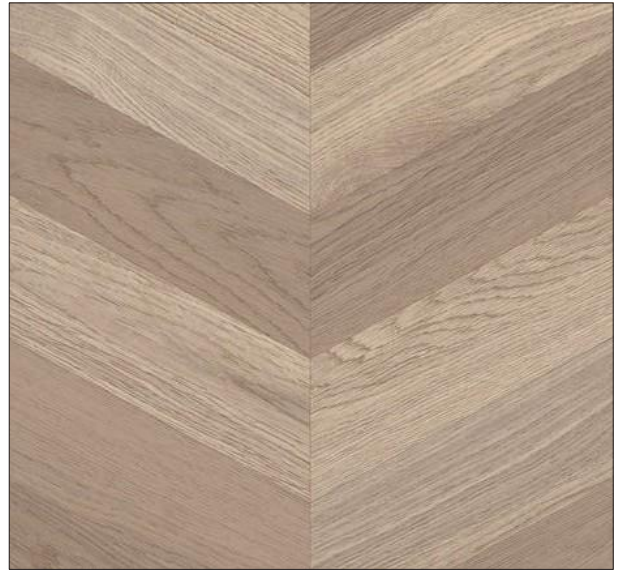
Chevron Style / Smoked -27123132