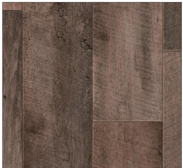
Authentic / Dark Brown -27123044